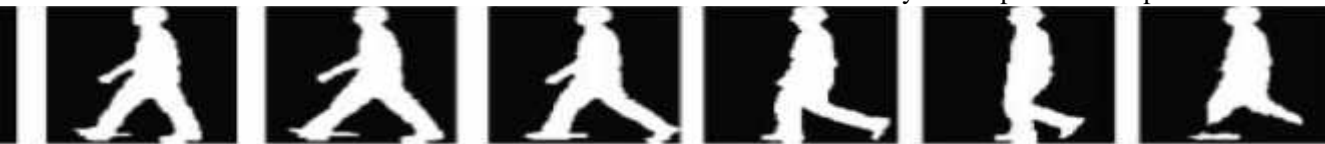
Figure 3: Original and aligned silhouette images. The rightmost image is the corresponding GEI.

where N is the number of frames in the complete cycle(s) of a silhouette sequence, t is the frame number of the sequence, and x and y are values in the 2D image coordinate (see Figure 3 for an example of GEI). GEI reflects shapes of silhouette and their changes over the gait cycle, and it is not sensitive to incidental silhouette errors in individual frames.