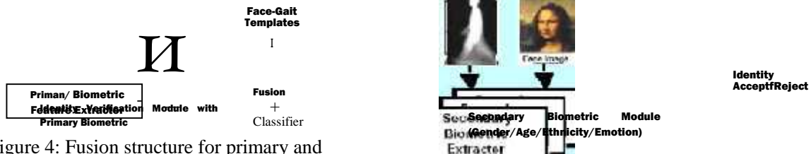
Figure 4: Fusion structure for primary and secondary identifiers using face and gait patterns.

additional demographic information about the user. They can certainly complement the identity information provided by the stronger biometric identifiers like face. The forensic identity recognition community have been using such soft characteristics for suspect and victim identification for a long time. The usage of secondary biometric identifiers - like the gender, age, ethnicity of the person, or the emotion- like aggression - on their own may not be useful to detect a criminal or identify an impostor. However, if used along with primary identifiers, it would be possible to enhance the robustness, reliability, and performance for different user and security requirements. Figure 3 shown below is the fusion structure for the combining primary and secondary identifier information