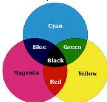
Fig. 2 CMYK Color Model

In CMYK color model the four-color printing process uses four printing plates; one for cyan, one for magenta, one for yellow and one for black. When the colors are combined on paper (they are actually printed as small dots), the human eye sees the final image. Graphic designers have to deal with the issue of seeing their work on screen in RGB, although their final printed piece will be in CMYK. Digital files should be converted to CMYK before sending to printers, unless otherwise specified.