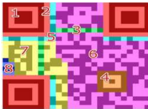
Figure 1: Structure of QR Code Version 2 (from [11])

Here we use as an example version 2, see Figure 1, which is the size that is most widely used, and based on [7], [8], [9], [10] analyze the structure of the QR Code.