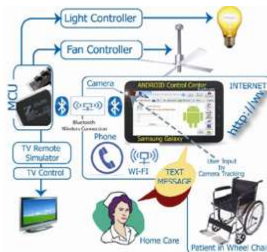
Figure 3: Android Based Interface System

In order to control the television and room lights, access to the room interface is required. The parallel output of the computer connects to the hospital room bed interface unit through the Hill-Rom SideComm connector. This connector is a 37 pin receptacle. In manual mode, the devices are activated when the buttons are pushed which triggers the contact between specific pins in the connector. For the computer interface, a contact switch is mimicked by using 5V reed relays appropriate for activation with TTL logic. Diodes are used to protect the parallel port from feedback signals. A logic one signal is sent through the parallel port for one second. This signal causes contact between the SideComm pins and enables the control of the device. For the home based system, alternative approaches for interface to the television unit are required. One option is to control the television with a Bluetooth interface.