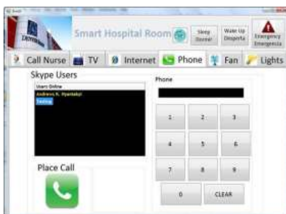
Figure 2: Virtual Phone Interface Layout

alternative is to use the internet and VOIP technology to make and receive phone calls. Various software exist that can easily accomplish this functions. The extra service charges are minimal and can be covered by either the patient or the hospital. This alternative saves time in the design process because the only additional requirement is a microphone and a speaker which is integrated into tablet devices. For the first generation prototype, Skype was selected for use in the GUI environment. The original version in Visual Basic 2005 required a separate launch of the interface which increased access time and complexity of the system. A newer version of the system was created in .NET and the Skype interface was incorporated directly into the GUI. This enhanced the access time and made the system simpler to control. An overview of the phone function layout is shown in fig. 2.