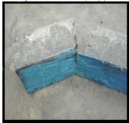
Figure 3. Failure of one sided CFRP.(7 days)