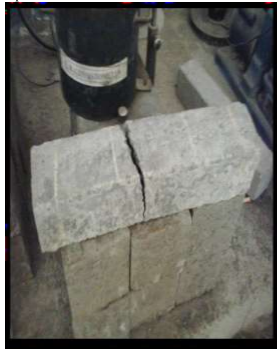
Failure of Plain Concrete Beam.(7 days)

sided CFRP wrapped concrete beams, Two sided parallel CFRP wrapped concrete beams ,Two sided parallel CFRP, Three sided continuous CFRP.The details of the load are thus given in the table 5.below.Figure (4-7) shows the failure modes for these beams. Figure (8-9) shows the graphical representation of the results.