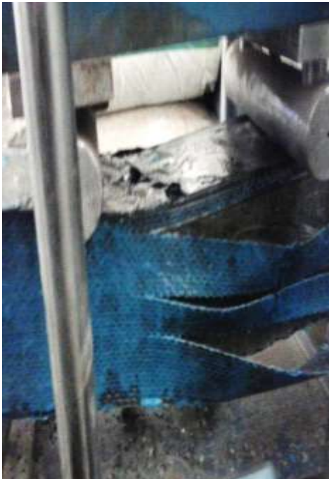
Figure 4: Failure of Two sided Parallel Figure 5. Failure of Three sided continuous CFRP wrapped beam.(7 days)

sides but gives less strength as compared to CFRP wrapped at three sides. CFRP wrapped at three sides gives higher strength but as the CFRP composite is costly it increasing the cost of construction so from an economic point of consideration CFRP wrapped at tension side to the beam is desirable.