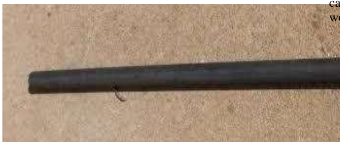
Mild steel rod

Mild steel rods are used for supporting sprockets with the help of bearing. Its main function is to provide equal force over the frame. It acts as axle rod and it provides greater strength.